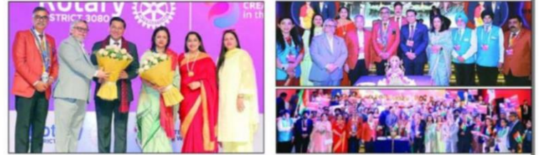
कार्यक्रम में बहुते अतिथियों का स्वागत करते व जानकारी देते हुए रोटरी जिला 3080 के पदाधिकारी व अन्य ।

पंजाब, हरियाणा, उत्तर प्रदेश, उत्तराखंड, हिमाचल प्रदेश और चंडीगढ़ के 108 क्लबों के प्रतिनिधियों ने लिया हिस्सा